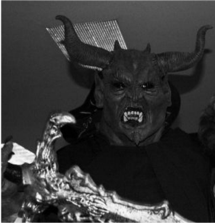
'Best Male costume' = skipper of 'Wild Hare'