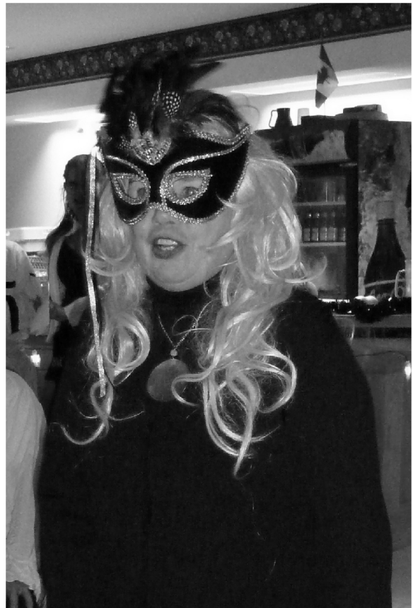
'Best Lady costume' - the admiral from 'Chardonnay'