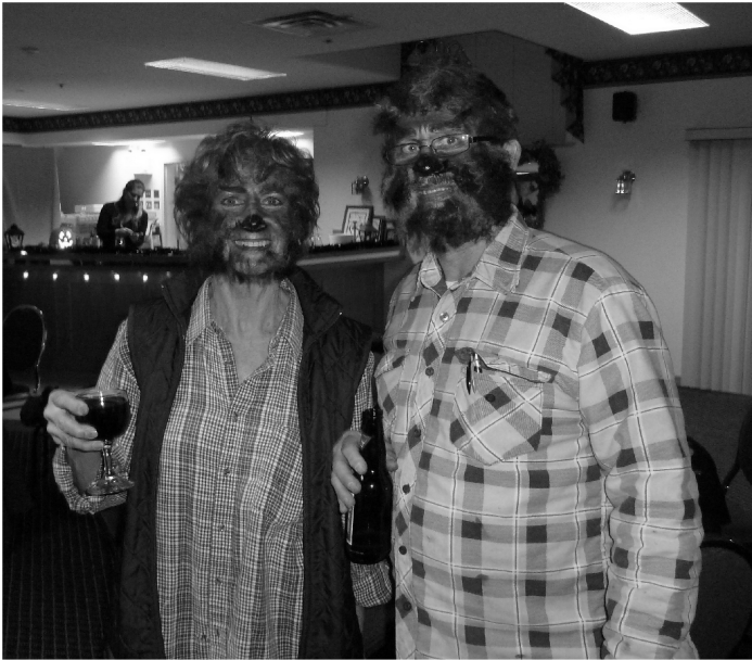
'Best Couple costume' - the crew from 'R&R'

29 October. Great company + great costumes + great food = another great Fraser evening!