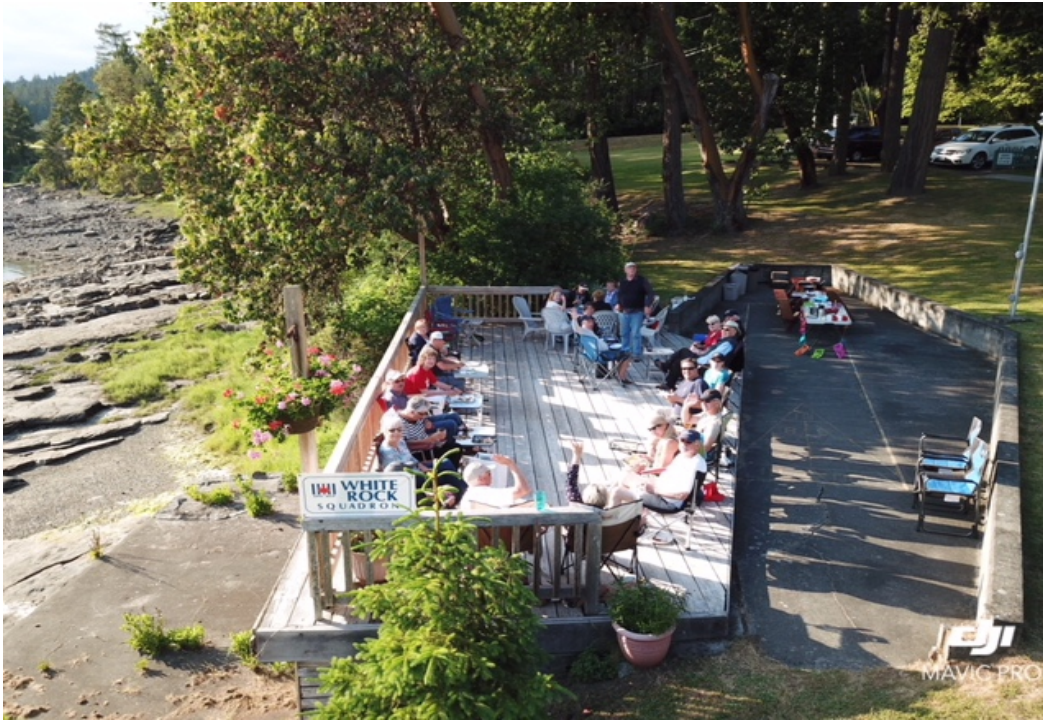
Above is a drone photo of the Telegraph Harbour Cruise