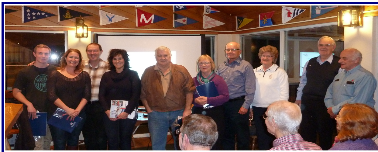
Graduates from the Fall, 2014 Boating Essentials courses receive their certificates

On the evening of January 30, 2015 we congratulated the graduates from our Fall, 2014 Boating Essentials