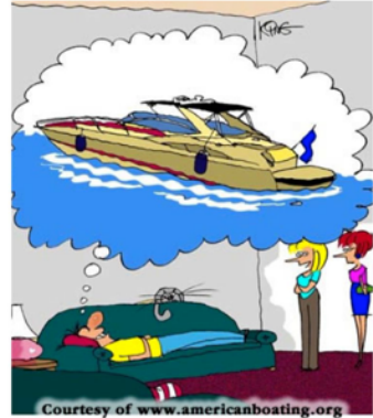
"How sweet, he's smiling. He must be dreaming about me."