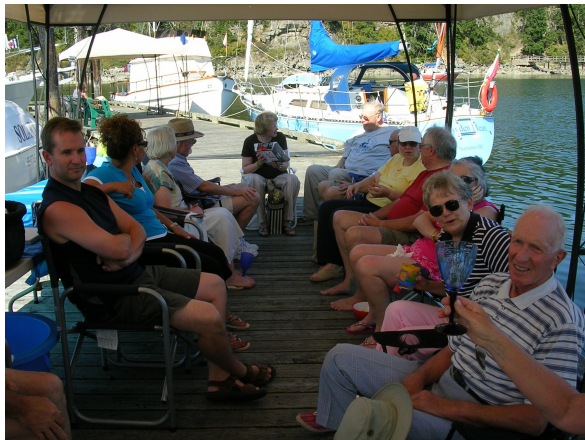
Visiting Ganges and the Saturday public market is always enjoyable. R&R arranged a fun contest and potluck dinner on the dock: