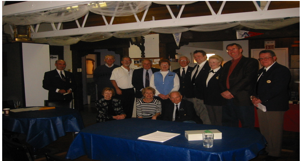
Celebrating the Spring graduation at the Airport Yacht Club