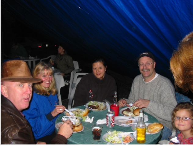
Good eats, good fun for young & old

Many thanks to all who participated and to members of the Bridge for the great job in organizing this fun event!