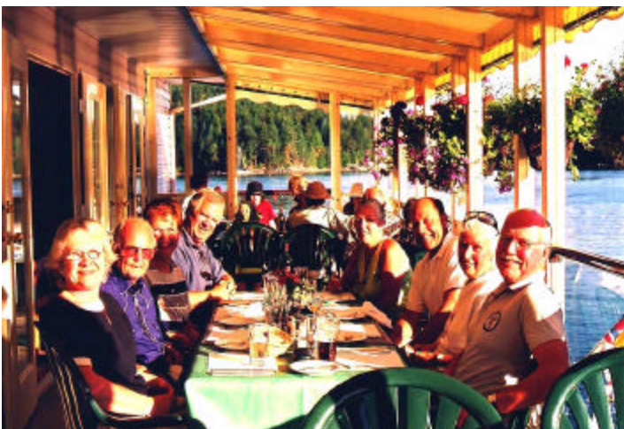
Dinner at Secret Cove

Our next destination was the Harmony Islands in Hotham Sound. We had rain, rain and more rain. There was time spent getting a secure anchor and stern tie, but of course everyone helps everyone, and all ended well with our usual "happy hour".