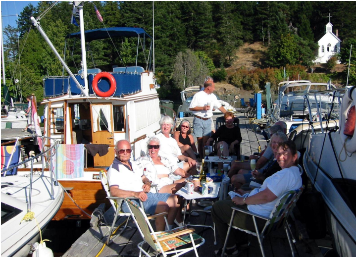
Dockside at Roche Harbour

Our third cruise took us to Roche Harbor. We had to forego staying a Rosario this time, because they could not accommodate some of our members who needed to stay at the dock. We had 7 boats at Roche, 6 in the marina and 1 anchored out. Most of us took advantage of the shuttle bus service across the island to Friday Harbor for a day of shopping or just enjoying a walk around this interesting harbor town. We also enjoyed a dip in the pool at Roche and took in a nice stroll through the outdoor gallery just behind the resort. Some of us went to Garrison Bay not far from Roche Harbor. This is a beautiful well protected bay. We anchored and took our dinghys ashore to tour the British Camp. Again nice walking trails and peaceful surroundings.