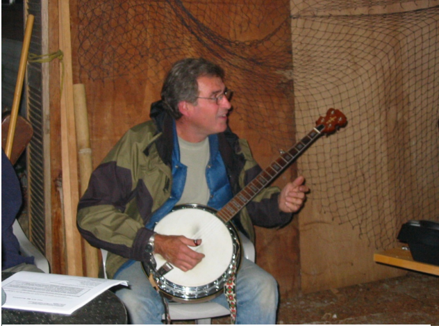
Down home entertainment

Many thanks to all who participated and to members of the Bridge for the great job in organizing this fun event!