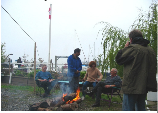
Campfire Chats ...